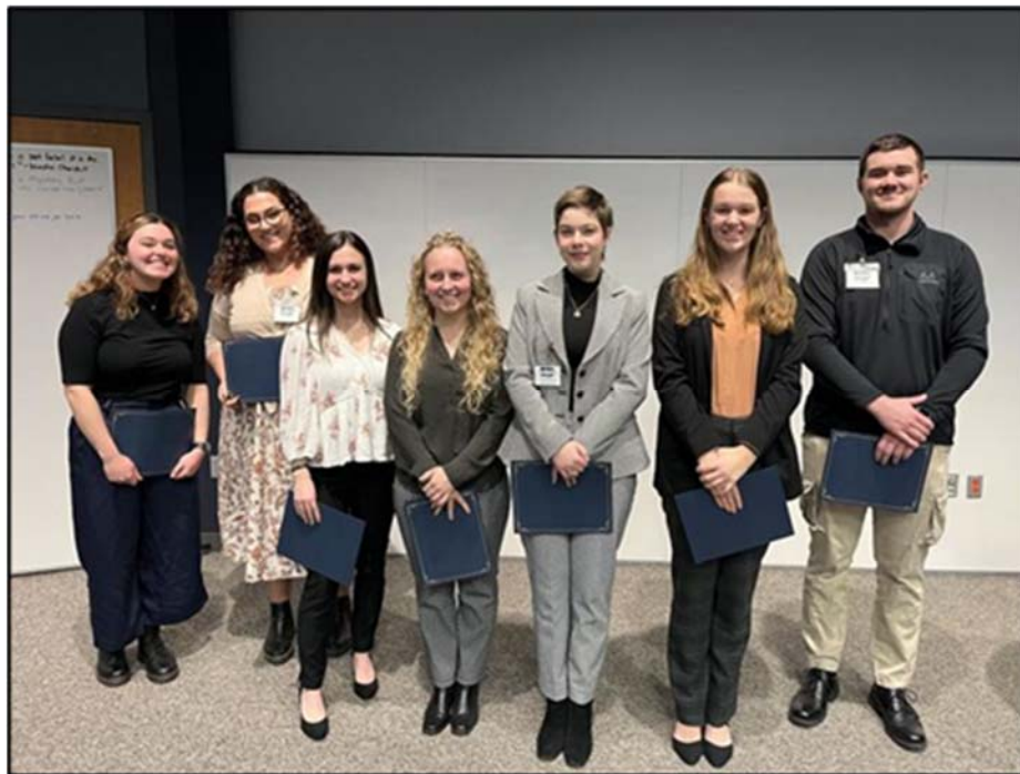
A group photo of several of the student winners and honorable mentions in the 2023 Student Symposium on the Environment (see front page article)