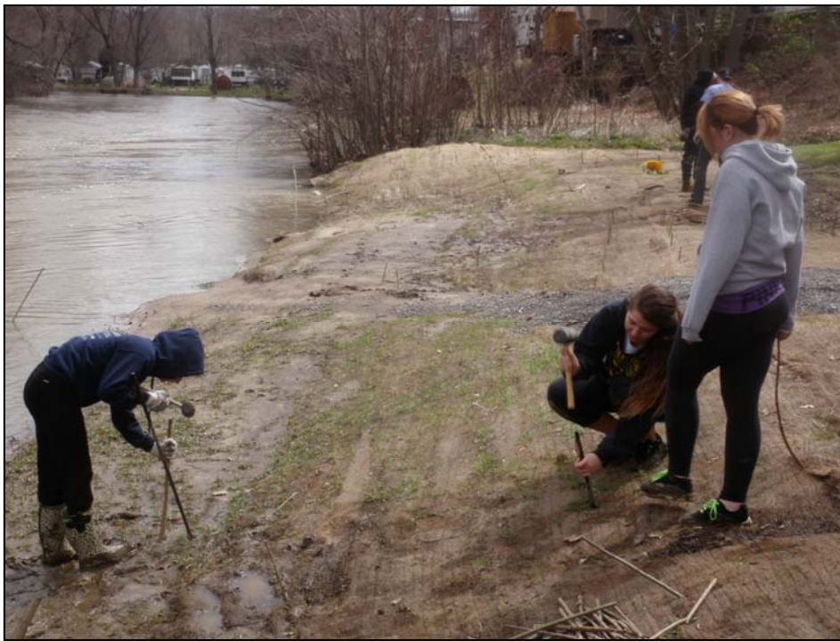
Stream bank planting in 2015 at the Slippery Rock Campground. Come help plant the newest project at the campground. See article on the first page.