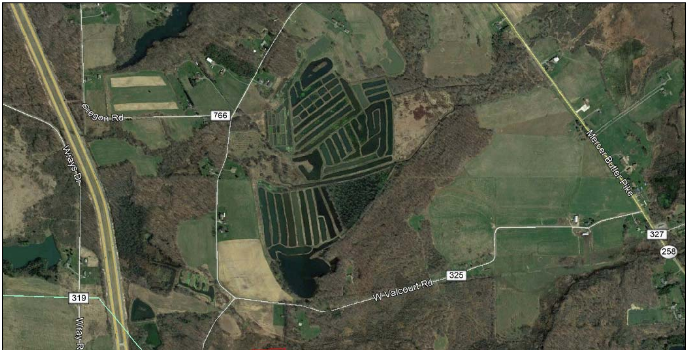
The ponds and wetlands located in the middle of the aerial photo have been added to State Game Lands 151.

Black Run, a tributary to Slippery Rock Creek, provides the source of water for the wetlands. The property is in the Celery Swamp Important Bird Area and Ducks Unlimited Northwest Pennsylvania International Conservation Priority Area and is within 30 miles of Pymatuning Reservoir and 60 miles of Lake Erie. The ponds and wetlands will provide an excellent stopover location for migratory birds and will provide habitat and foraging opportunities for birds and bats.