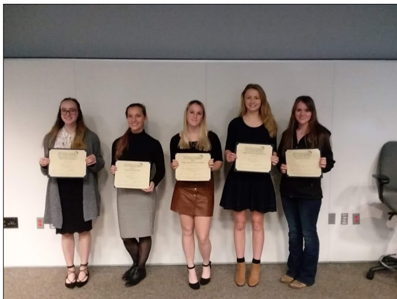
Student award winners pose for a photo at the December 5 th annual Student Symposium on the Environment. Over 80 students from western Pennsylvania colleges, universities, and high schools participated! See article, front page.