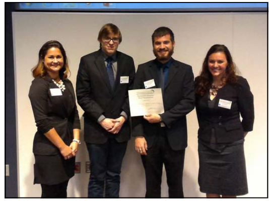
Student Symposium Award Winners (see first page for more information)