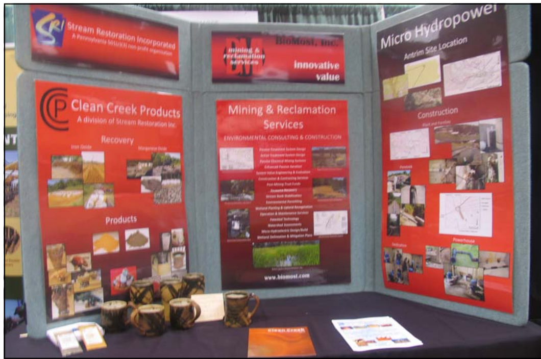
Stream Restoration Inc. and Clean Creek Products exhibit at the 2015 American Society of Mining and Reclamation annual conference in Lexington, Kentucky.