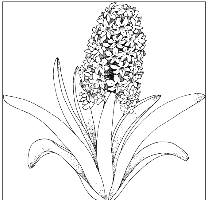
H Y A C I N T H