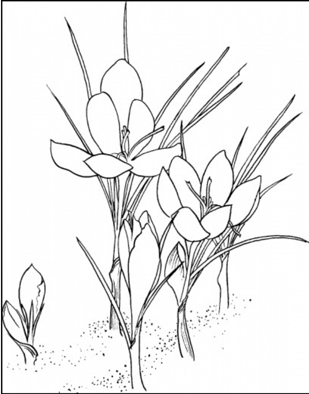
C R O C U S

Early spring flowers are a sure sign warmer weather is coming! Four early-blooming springtime flowers are pictured below for you to have fun coloring. Enjoy the beauty of these flowers as you notice them outdoors, and have a fun spring! If you mail us your completed paper, we'll send you a free gift certificate!