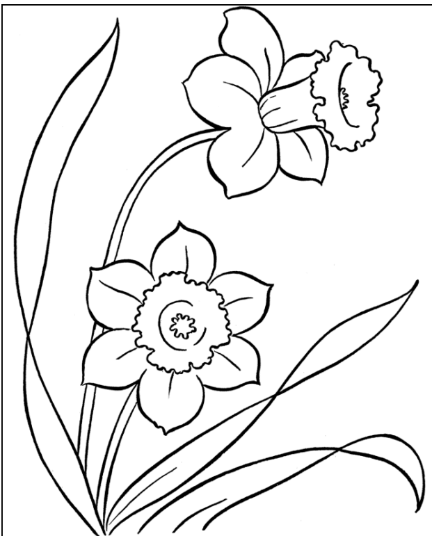
D A F F O D I L