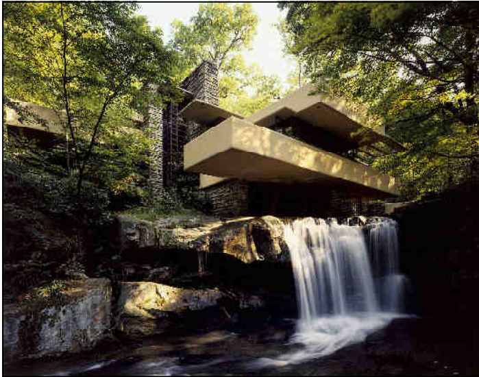
The breath-taking sight of Fallingwater.

Clean Creek Products (CCP) is excited to announce a partnership with Fallingwater and the Western Pennsylvania Conservancy (WPC). Our "green pottery" will be available at the Fallingwater museum store beginning in the spring of 2011! It is a privilege for CCP to collaborate with Fallingwater, a renowned historic landmark located in Mill Run, PA.