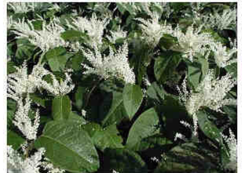
Japanese knotweed—an invasive to battle!

Help us restore native habitats in your state park. Invasive plants are a major factor in the decline of native plant species. Invasion by exotic species has been identified second only to habitat loss as a threat to biodiversity. In addition, introduction of these species is perhaps the most permanent and unrecoverable blow to native biodiversity and ecosystem processes/integrity. Once these species are well established it is sometimes impossible to remove them. Jennings Environmental Education Center is looking for interested individuals willing to spend a spring day pitching in at the park to help manage invasive plants. The war against the invaders is scheduled for April 23rd from 9 AM until 1 PM. Lunch and tasty samples of some recipes featuring invasive species will be provided! Participants must be age 12 or older and must register for the program by contacting the Center at 724-794-6011 no later than April 15. Participants must be prepared to work outdoors.