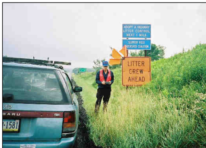
Charlie Cooper using a remote control camera set-up (more next month) to take his picture next to the Adopt-A-Highway sign.

We applaud the extreme effort of SRWC participant Charlie Cooper in his quest to clean up our adopted stretch of I-79! Charlie was a One Man Show one hot day this June, spending the majority of the day picking up trash between mile markers 100 and 101. As part of the Adopt-A-Highway Program , the SRWC routinely maintains this 1-mile patch of interstate, with Charlie spearheading the majority of our cleanup days. Thank you, Charlie, for your dedication to keeping our adopted road clean and green!! If you would like more information on when and how you or your organization can help us with our next Adopt-A-Highway clean-up, please contact Cliff Denholm at 724-776-0161. We provide a free lunch (yes, there IS such a thing!), gloves, and fashionable orange safety vests!