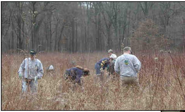
Ninety-one volunteers turned out for the 5th annual prairie improvement day held at Jennings Environmental Education Center on Saturday, January 21. Volunteers dedicated 270 hours of their time, and 8 restaurants donated hot, delicious soup.