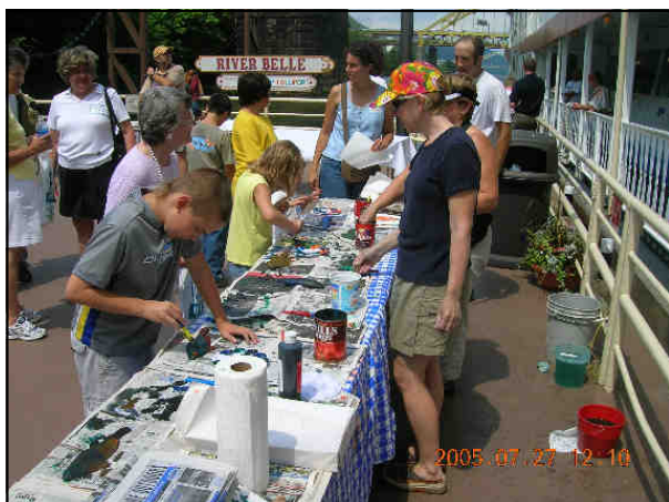
Kids have fun making "fish prints" at the 4th Annual Ohio River Watershed Celebration.