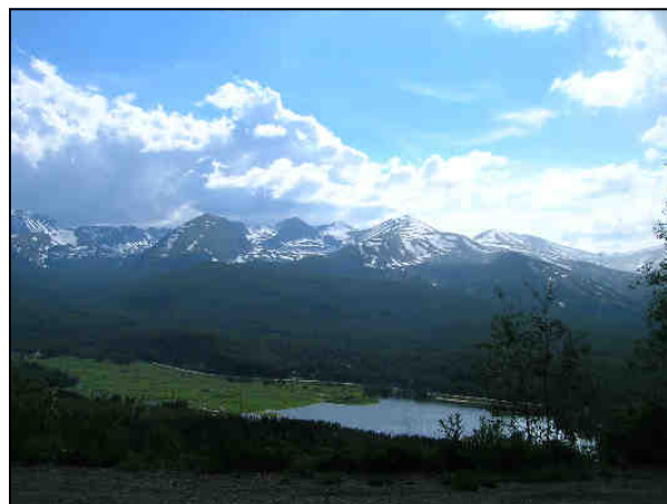
Beautiful sites in Breckenridge and surrounding towns added to the enjoyment of the ASMR Conference.